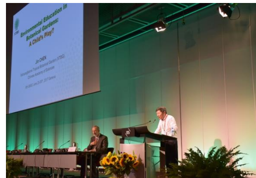
Prof. Chen Jin makes plenary speech

The 6th Global Botanic Gardens Congress of Botanic Gardens Conservation International (BGCI) was held at the City of Geneva, Switzerland from June 26-30. The congress brought together over 500 representatives of 300 botanical gardens from 70 countries and regions. 49 representatives from different botanical gardens in China attended the congress.